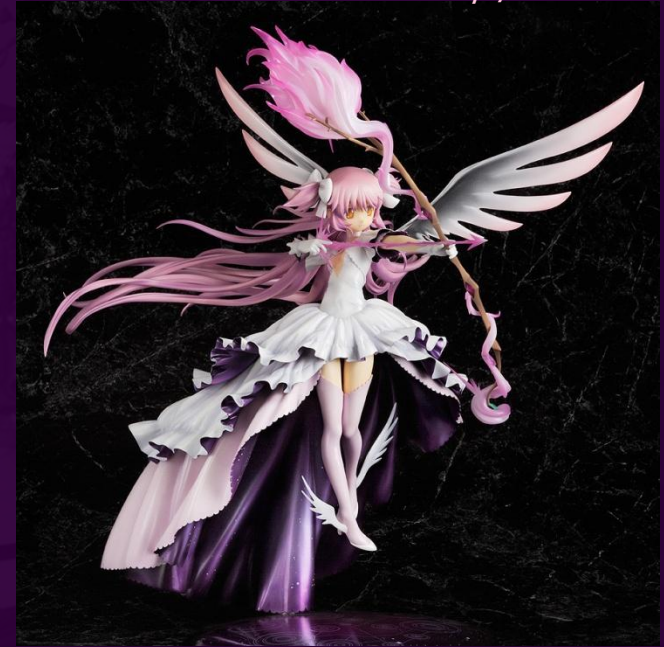
Ultimate Madoka 1/7