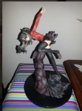
Rin Tohsaka (Fate/Stay Night) 1/8 Good Smile Company PVC