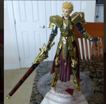
Gilgamesh/Archer (Fate/Zero) Chogokin