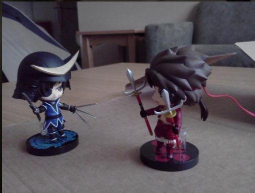
Date & Yukimura (Sengoku Basara) Nendoroids

On their way, Pre-ordered, & 'Wish List' Figures