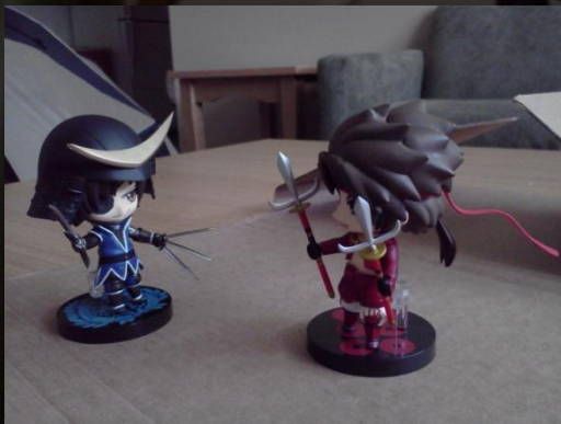
Date & Yukimura (Sengoku Basara) Nendoroids