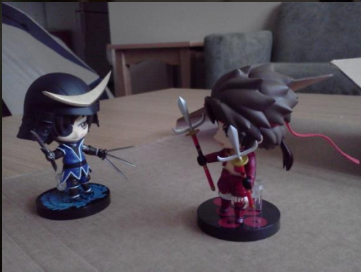
Date & Yukimura (Sengoku Basara) Nendoroids