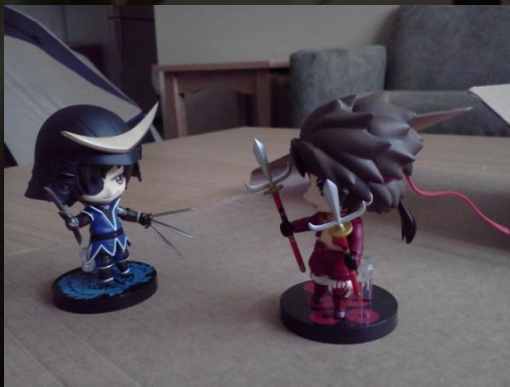
Date & Yukimura (Sengoku Basara) Nendoroids