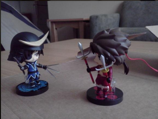
Date & Yukimura (Sengoku Basara) Nendoroids